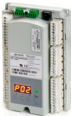
T400 Flame Safeguard

Eclipse recommends combining the T500 Series Actuator with the T400 Series Flame Safeguard for a perfectly integrated control solution. The T500 and T400 are designed to work in unison to deliver even more benefits when they are installed together. Choosing this globally approved package will provide you with easy ordering, lower installation costs, simplified start-up and precise burner control.